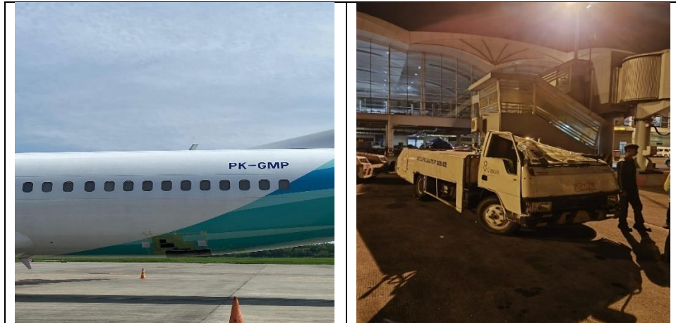
Figure 2. Structural damage aircraft and LST

among these nodes highlight how ORLIO-based human error evaluations stimulate reflective learning, while AMC supervision enforces procedural discipline. Together, they represent complementary mechanisms: ORLIO functions as an internal driver that fosters behavioral change through reflection and recognition, whereas AMC acts as an external controller ensuring short-term compliance. Nevertheless, the persistence of mechanical deficiencies (unserviceable GSE) and inconsistent rule enforcement continues to weaken both layers of defense. Supporting figures and analytical representations were refined to enhance conceptual clarity. Figure 2 provides visual context of the LST–aircraft collision, underscoring the real-world consequences of human and systemic failures. Figure 1 quantifies the scope of equipment unserviceability, reinforcing the mechanical dimension of latent failure.