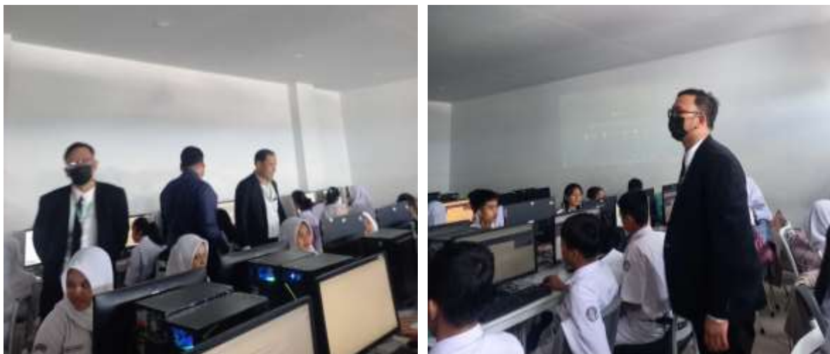
Figure 1. Training session on python programming

The training activities were implemented in several stages. The first stage was the preparation stage, which included coordination with the school, preparation of training materials, and development of evaluation instruments such as pre- and post-test questions. The materials were designed to introduce the basic concepts of Python programming and Artificial Intelligence in a simple and understandable manner for beginner-level students. The second stage was the implementation stage, where training activities were conducted in the form of lectures, demonstrations, and hands-on coding practice. During the lecture session, students were introduced to the importance of programming skills and the role of Artificial Intelligence in modern technology. The instructors explained the basic Python concepts, such as variables, data types, operators, and input-output commands. Students were also introduced to the basic concept of Artificial Intelligence and its applications in everyday life and various industries.