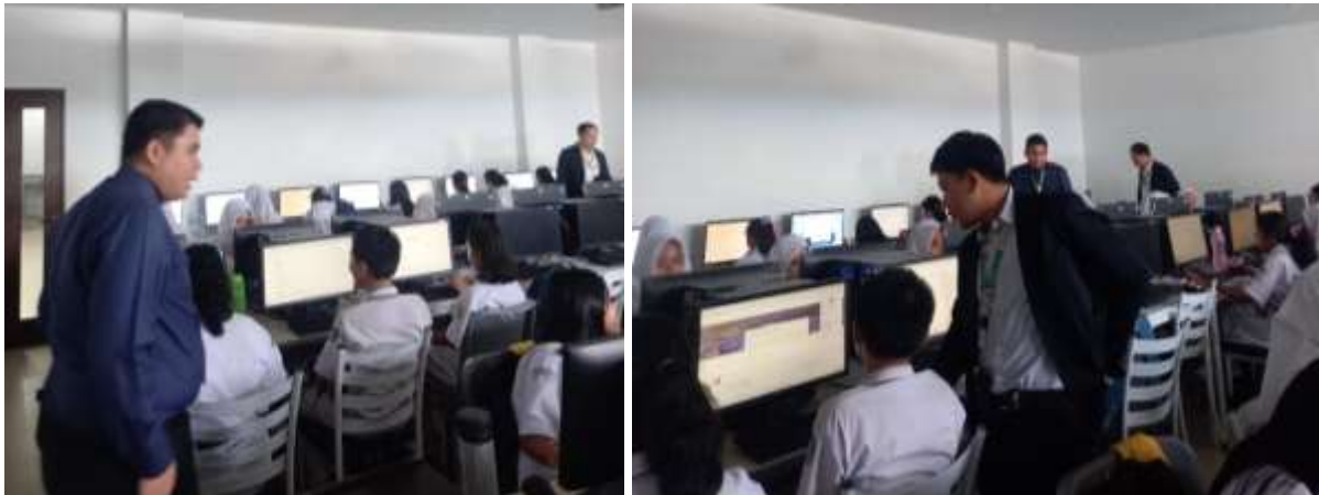
Figure 2. Students practicing python coding

In the demonstration and practice sessions, the students were guided to write simple Python programs using a code editor. They practiced creating basic programs, performing simple calculations, and displaying the outputs. The instructors also demonstrated simple examples of how AI systems work, such as pattern recognition and data-processing. This practical approach allowed students to directly experience the process of writing code and understand how programming works.