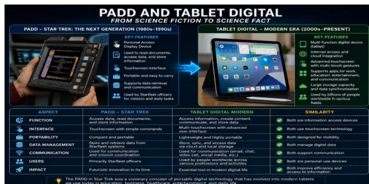
Figure 2. PADD and digital tablets

Figure 2 show PADD featured in Star Trek: The Next Generation bears a strong resemblance to modern digital tablets such as the Apple iPad and Samsung Galaxy Tab. In the series, the PADD was used to read digital documents, store information, access data, and facilitate portable communication (Zheng & Li, 2020). Its touchscreen interface enabled users to interact directly with digital content through the display screen. At the time the series was broadcast, portable touchscreen devices remained largely conceptual, as computing technologies were predominantly desktop-based and relied on physical keyboards (Grinschgl, Meyerhoff, & Papenmeier, 2020; Iqbal & Bhatti, 2020).