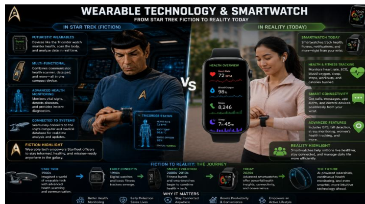
Figure 8. Wearable technology and smartwatch