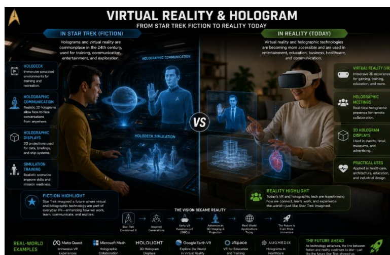
Figure 9. Virtual reality and hologram

Figure 9 show hologram and virtual simulation technologies portrayed in Star Trek share strong similarities with modern Virtual Reality (VR) and Augmented Reality (AR) technologies. In the series, holographic environments were used for training, simulation, entertainment, and immersive digital