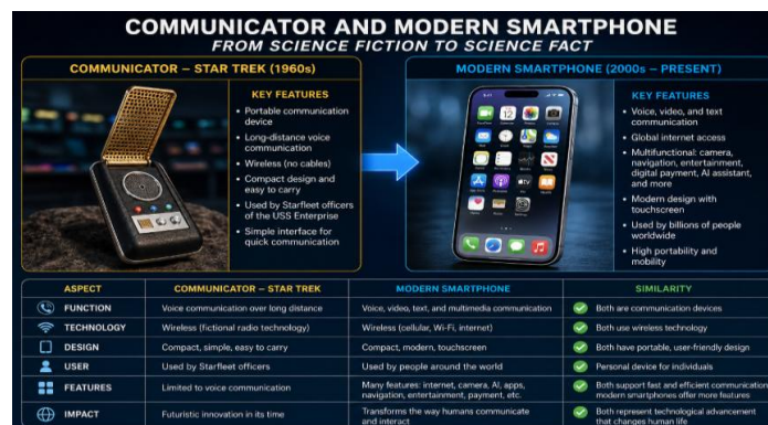
Figure 1. Communicators and modern smartphones

Figure 2 show communicator featured in Star Trek: The Original Series represents one of the futuristic technologies most comparable to modern smartphones. In several episodes, crew members of the USS Enterprise used the communicator as a compact and portable device that enabled instant wireless voice communication across different locations. Its lightweight design supported mobility and reflected the concept of personal communication technology long before mobile phones became widely adopted in society. The communicator not only facilitated long-distance communication but also introduced the idea of a practical and flexible device that could be carried and used anywhere. This concept closely resembles contemporary smartphones, which have evolved into multifunctional devices supporting voice and video communication, social media access, digital navigation, electronic transactions, and AI-based assistants. Advances in wireless networks, internet connectivity, and mobile computing have enabled many of the communication concepts portrayed in Star Trek to become part of everyday life. These similarities demonstrate how Star Trek anticipated the evolution of portable digital communication technologies decades before their widespread implementation. The communicator serves as an example of how science fiction can stimulate technological imagination and contribute to public expectations regarding the future development of communication technology.