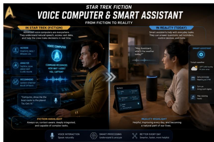
Figure 3. Voice computer and smart assistant

Figure 3 show voice computer system featured in Star Trek shares notable similarities with modern smart assistants such as Apple Siri, Amazon Alexa, and Google Assistant. In the series, crew members of the USS Enterprise interacted with the ship's computer through voice commands to retrieve information, operate onboard systems, perform data searches, and support decision-making processes