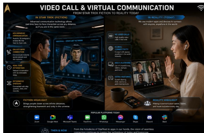
Figure 5. Video call and virtual communication

The visual communication system portrayed in Star Trek shares strong similarities with modern video communication platforms such as Zoom, Google Meet, and FaceTime. In the series, communication between spacecraft and crew members was conducted through visual screens that enabled real-time audio and video interaction (Paredes-Frigolett, Pyka, & Leoneti, 2021). At the time the series was produced, such communication capabilities were largely considered futuristic because internet infrastructure and digital communication networks were still in their early stages of development. Nevertheless, Star Trek presented a vision of long-distance communication supported by interactive visual technologies (Lindsay, 2022).