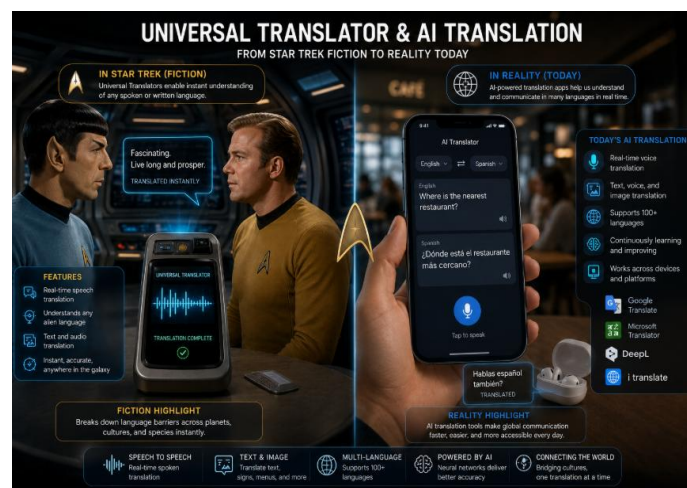
Figure 4. Universal translator and ai translation

Figure 4 show universal translator featured in Star Trek bears strong similarities to modern AI-based translation technologies such as Google Translate and real-time translation devices. In the series, the universal translator enabled automatic communication between different species by translating multiple languages instantly and accurately ( Tan et al., 2020 ). The device illustrated the concept of automated language processing and real-time translation long before such technologies became widely available. Its functionality reflected the ability of intelligent systems to recognize, interpret, and translate foreign languages during communication ( Gaspar, Correia, & Torres, 2021 ). Recent advances in artificial intelligence, speech recognition, neural machine translation, and machine learning have enabled the development of translation technologies capable of automatically converting spoken and written language into different languages in real time. These technologies are now widely integrated into smartphones, wearable translation devices, and global communication systems, facilitating communication across linguistic boundaries ( Tigga & Garg, 2020 ).