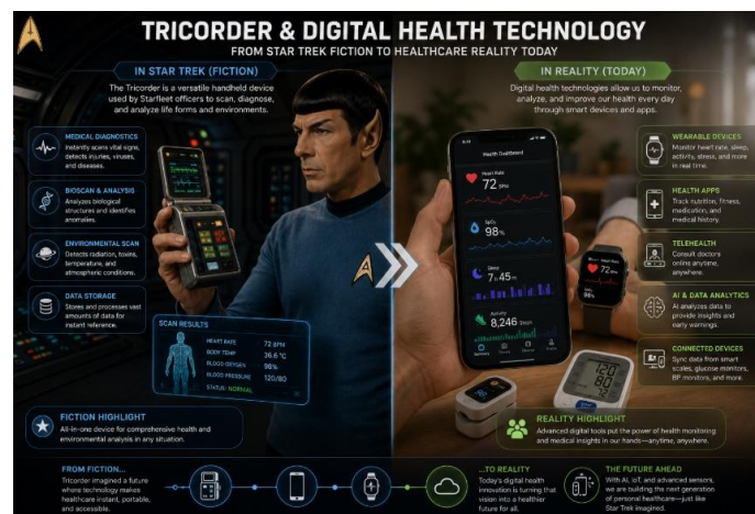
Figure 6. Tricorder and digital health technology